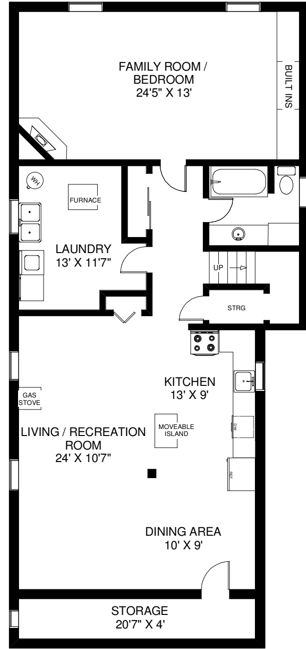
LOWER FLOOR APPROXIMATELY 1,425 SQ FT

Note: Measurements & Calculations are approximate. Provided as a guideline only.