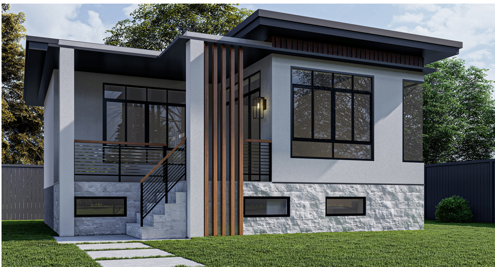
“The Ontario” model - recessed garden suite concept from Laneway Housing Advisors

The new building is a mostly-autonomous auxiliary dwelling unit, normally up to 6.0m (19.68 feet) tall (4.m tall, here), that cannot be legally severed from the main property, but is permitted a wide variety of uses, including as a revenue-producing (rental) unit. Where practical, some will have optional indoor vehicle parking.