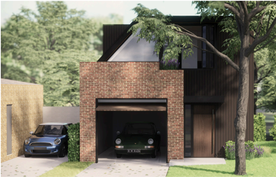
Single-vehicle garden suite from Toronto's Eva Lanes www.evalanes.com

The new garden suite regulations received political approval at Toronto City Hall on February 2, 2022, and on July 4, 2022 emerged successfully from an appeal process that had delayed the implementation slightly.