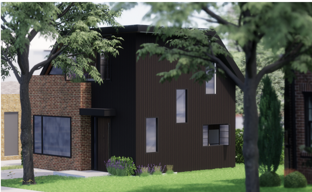
2-storey garden suite from Toronto’s Eva Lanes

The new building is a mostly-autonomous auxiliary dwelling unit, normally up to 6.0m (19.68 feet) tall, that cannot be legally severed from the main property, but is permitted a wide variety of uses, including as a revenue-producing (rental) unit. Where practical, some will have optional indoor vehicle parking.