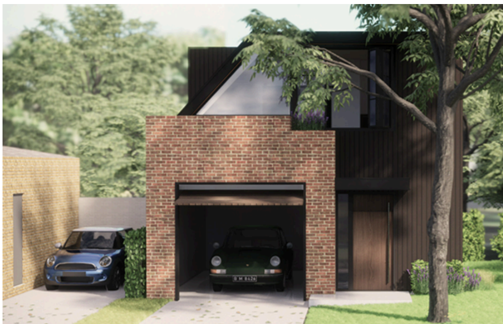
Single-vehicle garden suite from Toronto's Eva Lanes www.evalanes.com

In order to take advantage of this relief, the property owner should not deconstruct or demolish or alter the existing structure until permits are in place for the new garden suite.