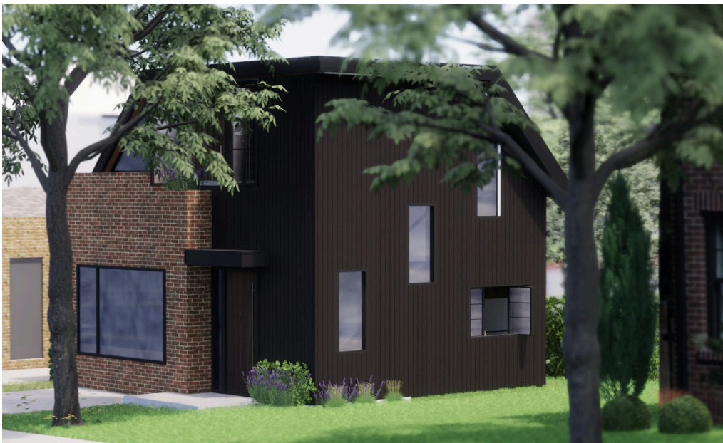
2-storey garden suite from Toronto's Eva Lanes - www.evalanes.com

The new building is a mostly-autonomous auxiliary dwelling unit, normally up to 6.0m (19.68 feet) tall, that cannot be legally severed from the main property, but is permitted a wide variety of uses, including as a revenue-producing (rental) unit. Where practical, some will have optional indoor vehicle parking.