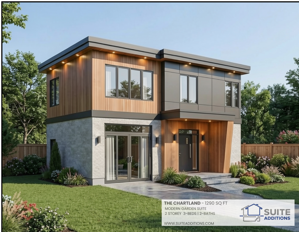
2-storey garden suite from Suite Additions .

footprint does not exceed 645.8 square feet. Walls with windows or doors must be placed at least 4.9 feet away from the respective property lines.