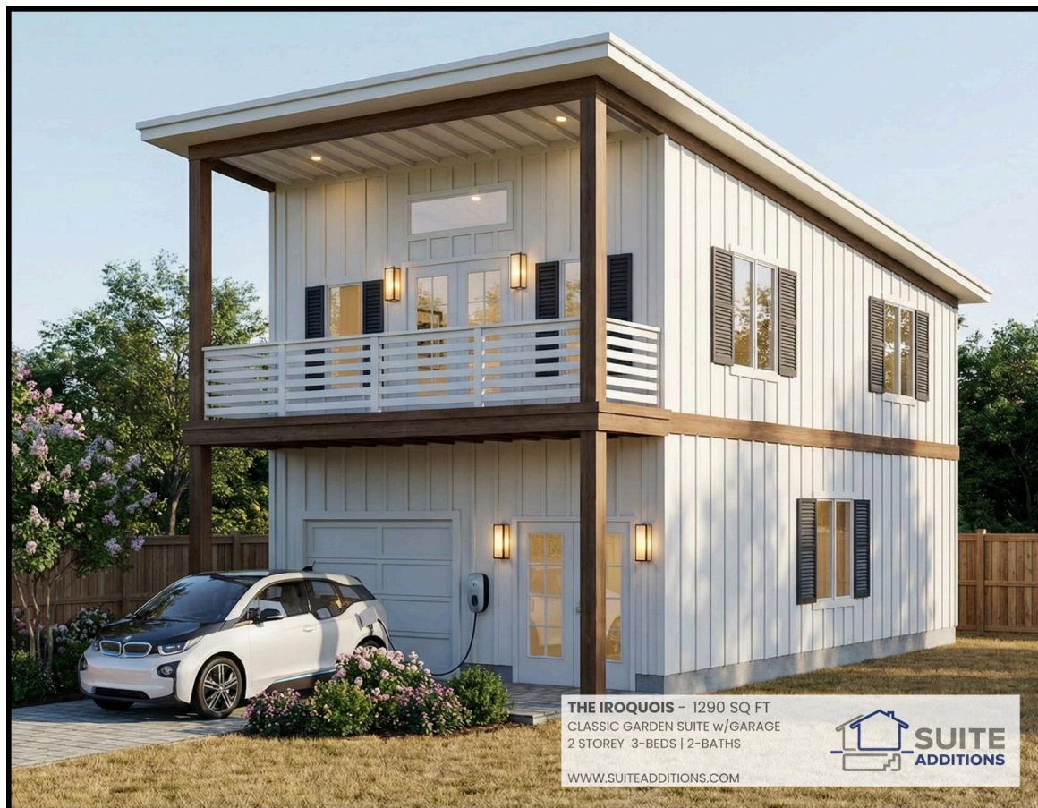
2-storey garden suite from Suite Additions .

The new garden suites program from the City of Toronto allows qualifying property owners to construct a garden suite “as of right” on their property, with simple building permit application and no political approval or committee of adjustment approval required. In most cases, no variances are required and no appeals or “neighbour vetoes” are permitted. The city also waives development cost charges.